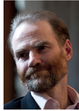
Timothy Garton Ash

Timothy Garton Ash, on behalf of the Steering Committee.