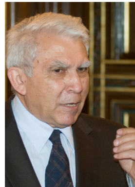
Adam D. Rotfeld